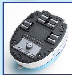
On-board storage in base for PCR rotor and adapters

C1008 myFuge Mini, 6000rpm/2000xg, choice of color $269.00/2 Add (-B) for Blue, (-P) for Purple, (-C) for clear